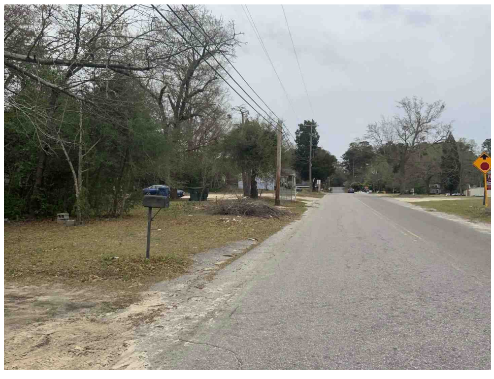
Form PIC4X6.SR - "TOTAL" appraisal software by a la mode, inc. - 1-800-ALAMODE