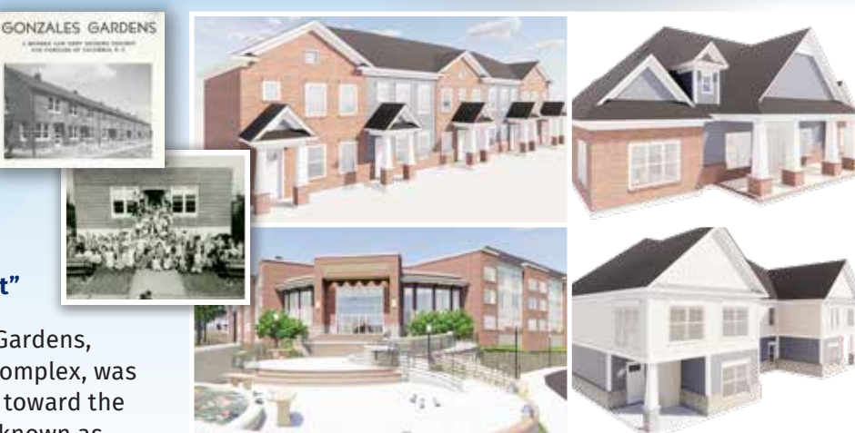
95 Unit Senior Building • 190 Townhomes

Nearly three years after Gonzales Gardens, Columbia's oldest public housing complex, was demolished, momentum is gaining toward the development of a new community known as Oaks at St. Anna's Park.