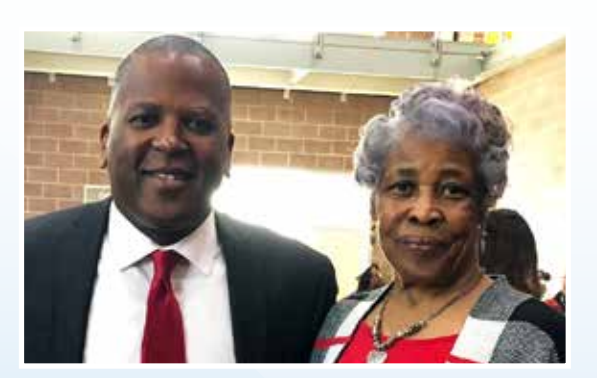
Red for Women Day February 7, 2020